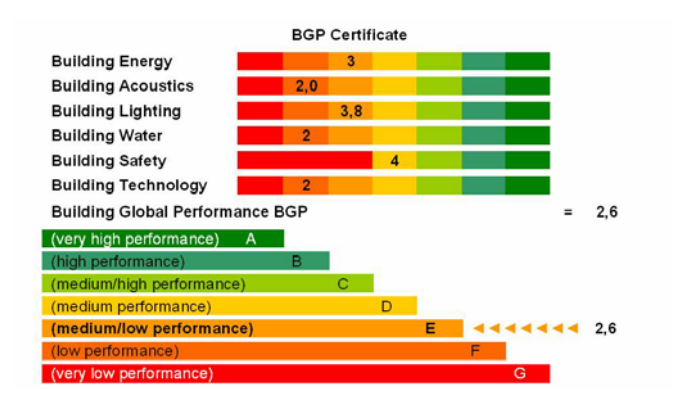
Fig. 1. An example of BGP Certificate, based on Building Global Performance index BGP.

Overall quality means an energetic-environmental assessment of building as a complex system. Single contribution indexes were proposed to evaluate energy performance according to energy certification, together with acoustic insulation, artificial lighting and natural light, rational use of water and renewable resources, safety into buildings and technological devices. As a result, BGP index was defined to classify both new and existing buildings (Fig. 1).